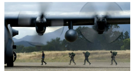
A KC-10 Extender from Travis AFB refuels an F/A-22 Raptor (top). Airmen and Soldiers board a C-130 Hercules aircraft to participate in a training exercise (bottom).